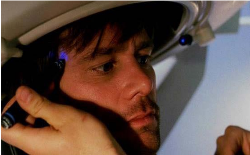
Figure 6. Eternal Sunshine... (2004). Joel Barish in Lacuna Inc., to erase memories. Source: http://www.doyoulikemoviesaboutgladiators.com/the-20-best-movies-of-the-decade/ .

The film then focuses on the process to which Joe is subjected, made while asleep under the effect of drugs, which once started transports him into his memory, as his memories are progressively erased, starting with the most recent ones. However, in the middle of the process Joel discovers that he still loves Clementine (or Clem, as he called her) - this happens when he relives the initial moments of the couple's relationship, and they come to mind to be erased - and he doesn't want to continue the operation of obliteration, which in technical terms is a brain injury, as the doctor in charge explained to him. But how can you reverse the process if you are asleep?