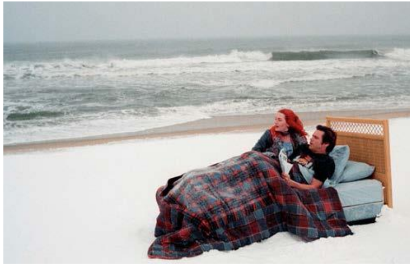
Figure 7. Eternal... (2004). Joel Barish and Clementine by the sea.