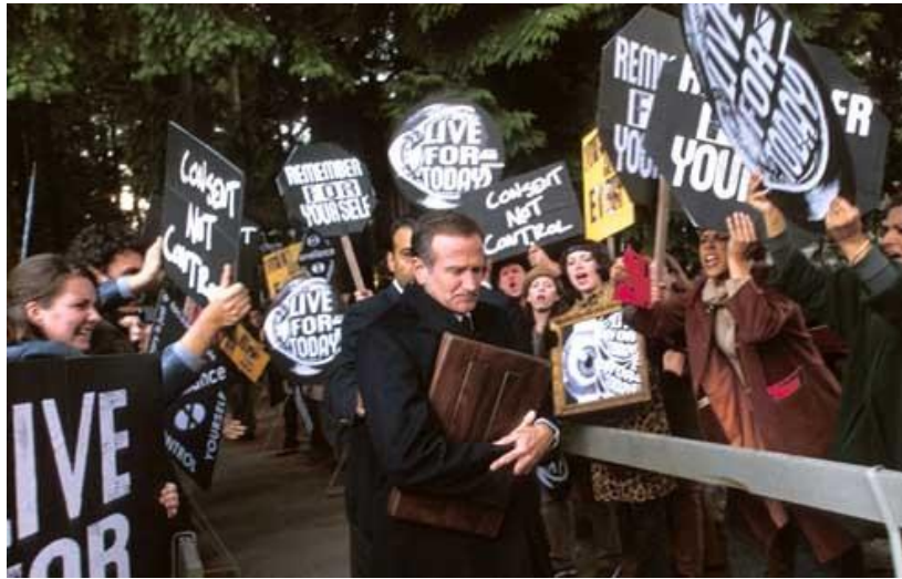
Figure 4. Final Cut (2004). Demonstration of Zoe anti-implant groups.