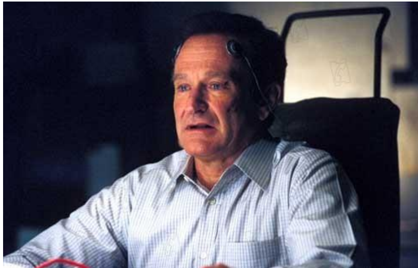
Figure 3. Final Cut (2004). Alan visualizes the desired remote memories.

life', he will visualize that desired remote memory - Alan needs to see, because that is how he records all things, used to being a voyeur of the lives of others - to reach the conclusion that he had after all confused in his memory the red ink spilled from a can, with a stain of blood on the ground next to his companion's body. This confusion reminds the viewer of something Alan had previously said to his girlfriend when, in another scene, he showed her on the Guillotine the functioning of the Zoe chips , with images of herself, half real, half dreamlike: "There are defective implants, they cannot differentiate between what the eyes and the mind see".