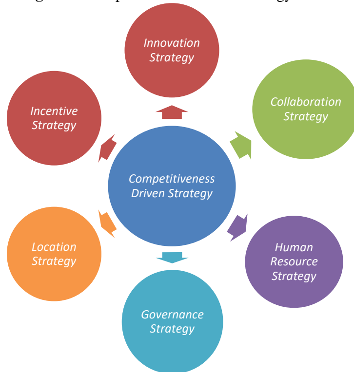
Figure 2. Competitiveness Driven Strategy Model