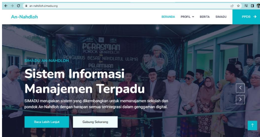
Figure 2. Guest Application Menu

The outcome of the application design is known as the SIMADU An-Nahdloh application, which stands for Sistem Informasi Manajemen Terpadu (Integrated Management Information System). This system can be accessed through https://an-nahdloh.simadu.org/ or via Google search [19].