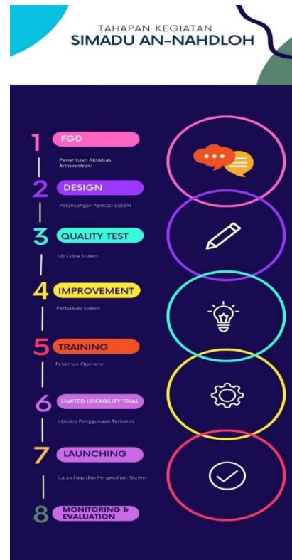
Figure 1. Stages of SIMADU AN-NAHDLOH Activities