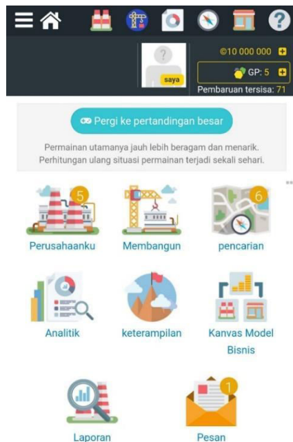
Figure 2. The Initial View of Business

This game simulated business making based on the existing modern economy. The students were demanded to analyze data presented by the simulation, build a business model, experiment and test their business to solve the modern economic problems. The game is structured into subsequent sessions to help students solve economic problems sequentially through different models.