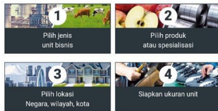
Figure 1. Virtonomics Game