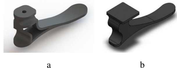
Fig. 2. Artificial Ankle Foot Design Alternative 1 (a) and Alternative 2 (b)