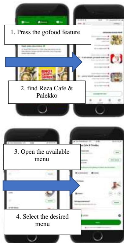
Figure 4.3 Display of the use of the Gojek application

From Figure 4.2 it can be seen about the appearance of the grab application when a customer is going to place an order for food and drinks, where from the "1" display the customer will select the food feature then the "2" display appears which directs the customer to search for the desired restaurant or cafe or restaurant. When the customer selects Reza & Palekko Cafe, then the "3" display will display the menu in Reza & Palekko Cafe, the customer will select the desired menu and will appear on the "4" menu that has been selected. If it is appropriate then the display "5" appears to confirm the order and after confirmation will appear display "6" where the customer can choose the desired payment method.