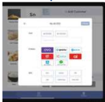
3. Choose a payment method