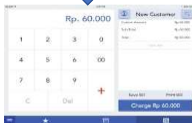
4. Print order tickets

From Figure 4.4 it can be seen about the appearance of the use of the MokaPos application in processing customer orders online. Where on Display “1” you can see a notification on online orders. Online orders show customer orders from both Gojek and Grab, which then the list of orders and their prices will appear on display “2”. When the cafe confirms the availability of the order, the payment method will appear as display “3”. The cashier will choose according to the payment method the customer has chosen. Then the options appear on the “4” screen Save bill and Print Bill. Usually the Cafe will choose Save Bill to wait for driver confirmation first. Then choose print bill to print Order Ticket which will then be processed in the production section