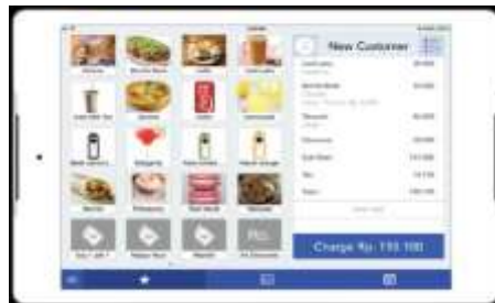
2. Customer order list