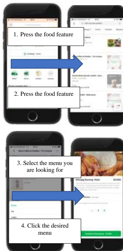
Figure 4.2 Display of the use of the grab application

Based on extract 1, it can be seen that the efforts made by Cafe Reza & Palekko to maintain sales in order to keep running in the new normal era, where most community activities are limited so that there are no crowds or crowds to break the chain of transmission of COVID-19 is to use the Gojek application. and Grab. However, for users, this Grab and Gojek application is more for its customers, the display of using the Grab and Gojek application will be described in the following image.