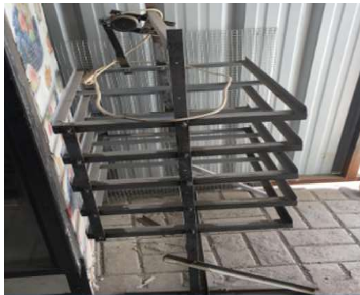
Figure 3: Turning machine