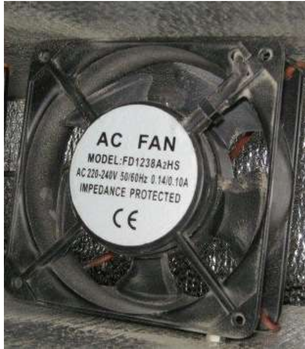
Figure 5:- The fan of ventilation duct