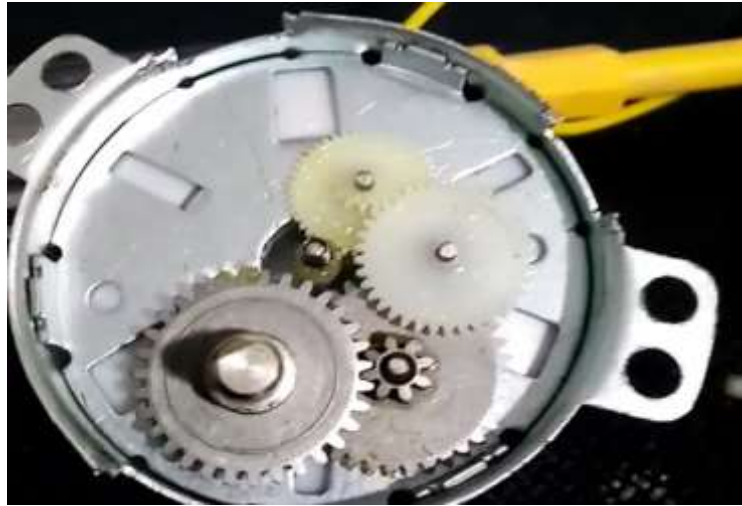
Figure4:- The gear box of the electric motor