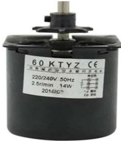
Figure2:- – Electric motor

The arm should connect in distance equal 1/4 of the tray length (Figure3). Moreover, the motor has a small gear box to reduce the speed (figure4). The electric motor consume 0.14 watt and should run only 12-14 second to turn the eggs 45 angle to right side then after 6 hours run 12-14 second to turn the eggs to the left side. This can be governing by electronic control.