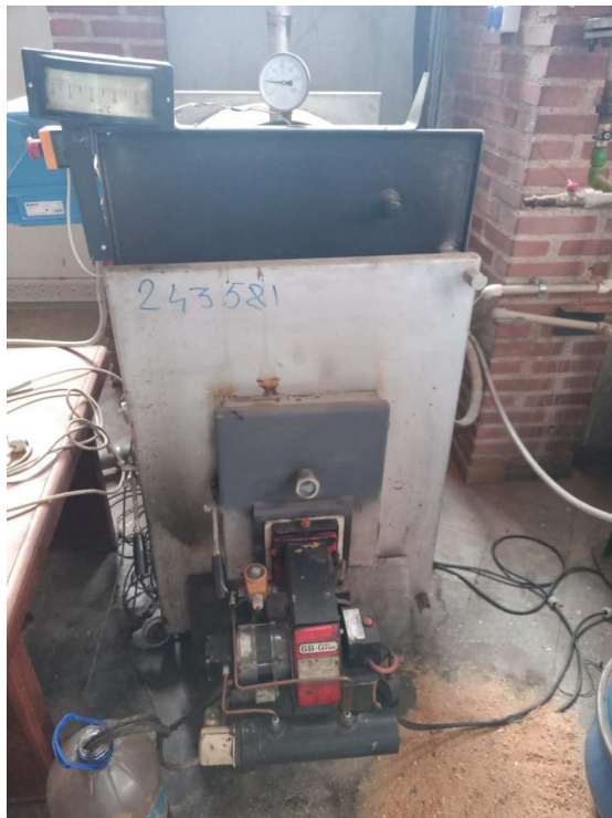
Fig. 3. General view of the pilot boiler

The pilot boiler is equipped with a grill and has a natural draft. After the firebox, the boiler is fitted with a heat exchanger with flue pipes. Combustion efficiency is measured by sampling combustion gases at the exit from the boiler, with a TESTO-350 analyzer. Figure 4 shows the experimentally tested briquettes in the combustion process.