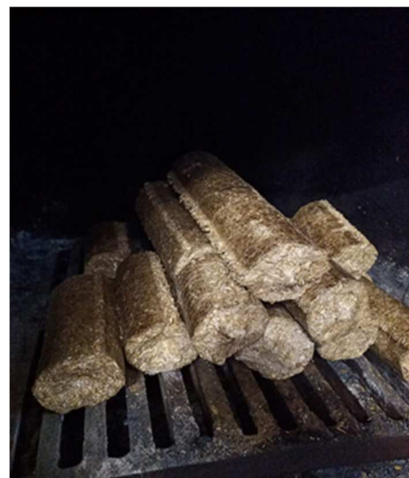
b. Straw briquettes on the grate