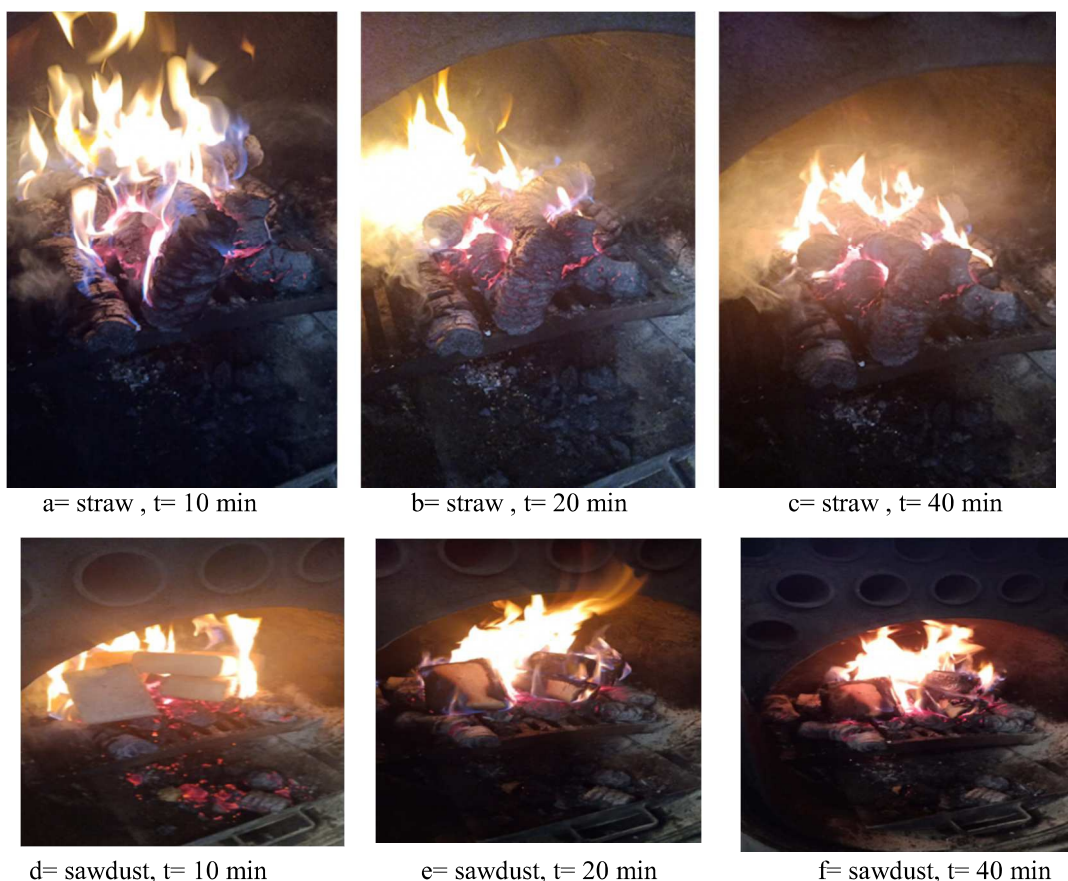
Fig. 5 Combustion of biomass briquette