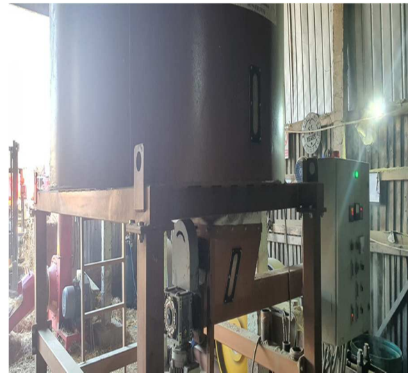
Fig. 1. General view of the briquetting installation

The briquetting of wheat straw in the Oltenia region involves a working temperature of approximately 100^\circ\text{C} , the initial humidity of the straw being 10-12%. Energy consumption during pressing is 0.12 \text{ kWh/kg} . Figure 1 shows an overview of the facilities, with a production of 300kg/h.